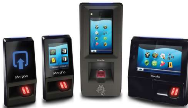
THE SIGMA FAMILY